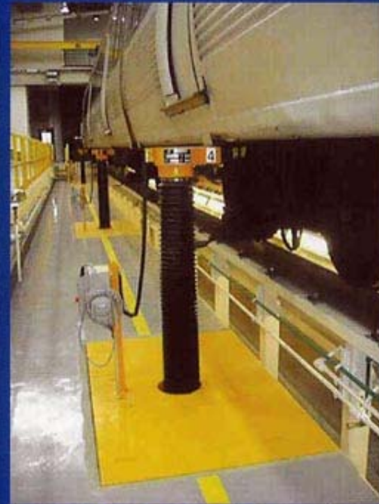
Special Body Lifters for Body Height Adjustment Purposes