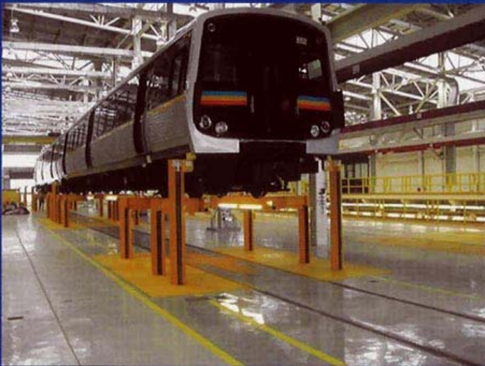
Close-up view - Married Pair Car Set on Car Hoists & Body Stands

MARTA, Armour Yard Rail Services Facility