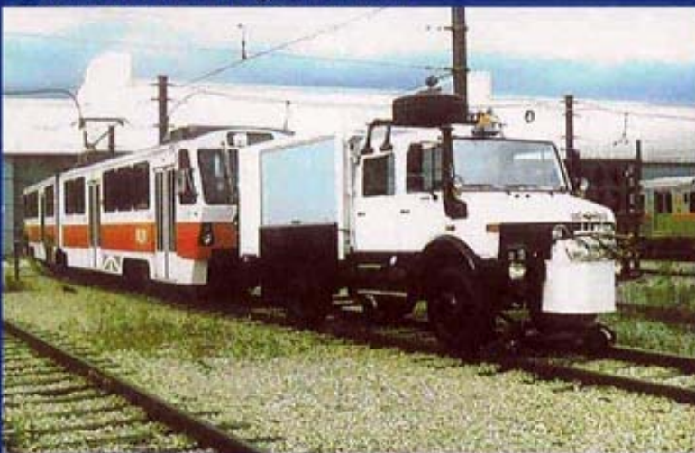
Unimog Rerailing Vehicle & Car Mover

The company's major product range includes the following: