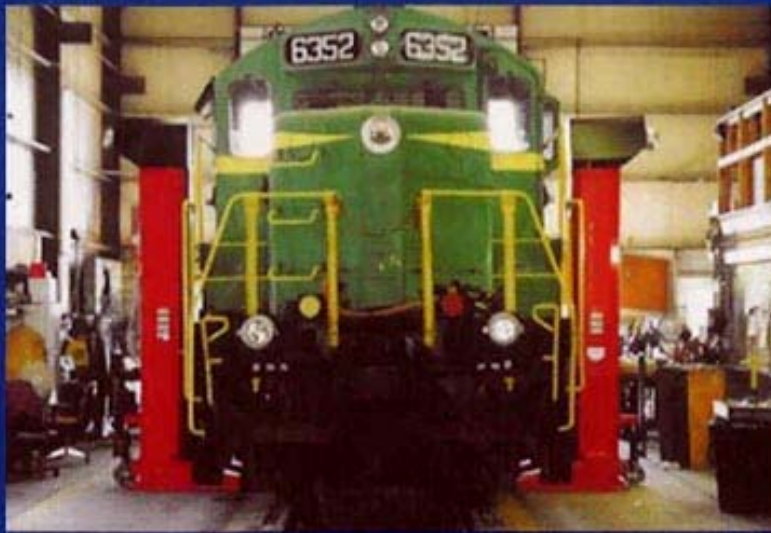
35-Ton Locomotive Jack System and Control Console